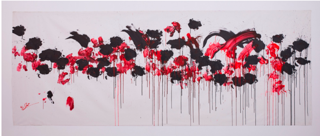
《Black and Red on White》 Ushio Shinohara, acrylic on canvas, 184×481cm, 2013 ©Ushio + Noriko Shinohara, courtesy of ANOMALY

*Opening reception: 2/17 Fri. 16:00~19:00 (No reservation required)